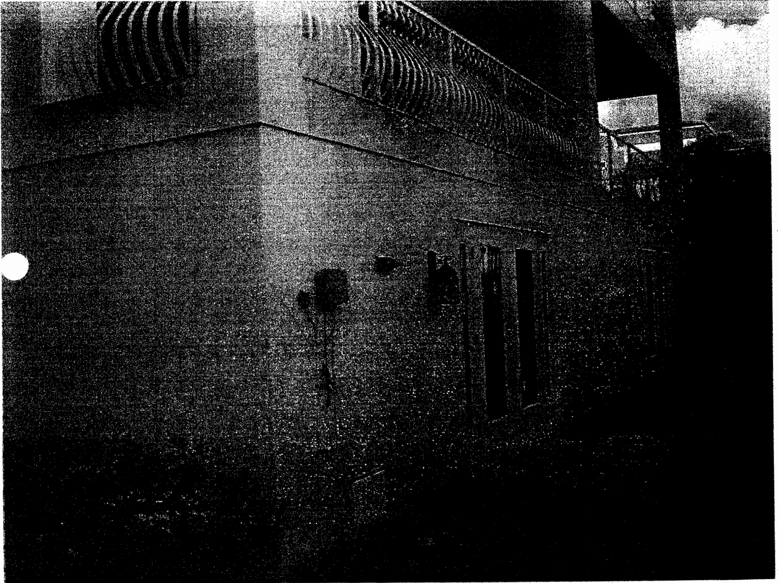
REAR VIEW 8-13-09

If submitting more photographs than will fit on the preceding page, affix the additional photographs below. Identify all photographs with: date taken, "Front View" and "Rear View"; and, if required, "Right Side View" and "Left Side View."