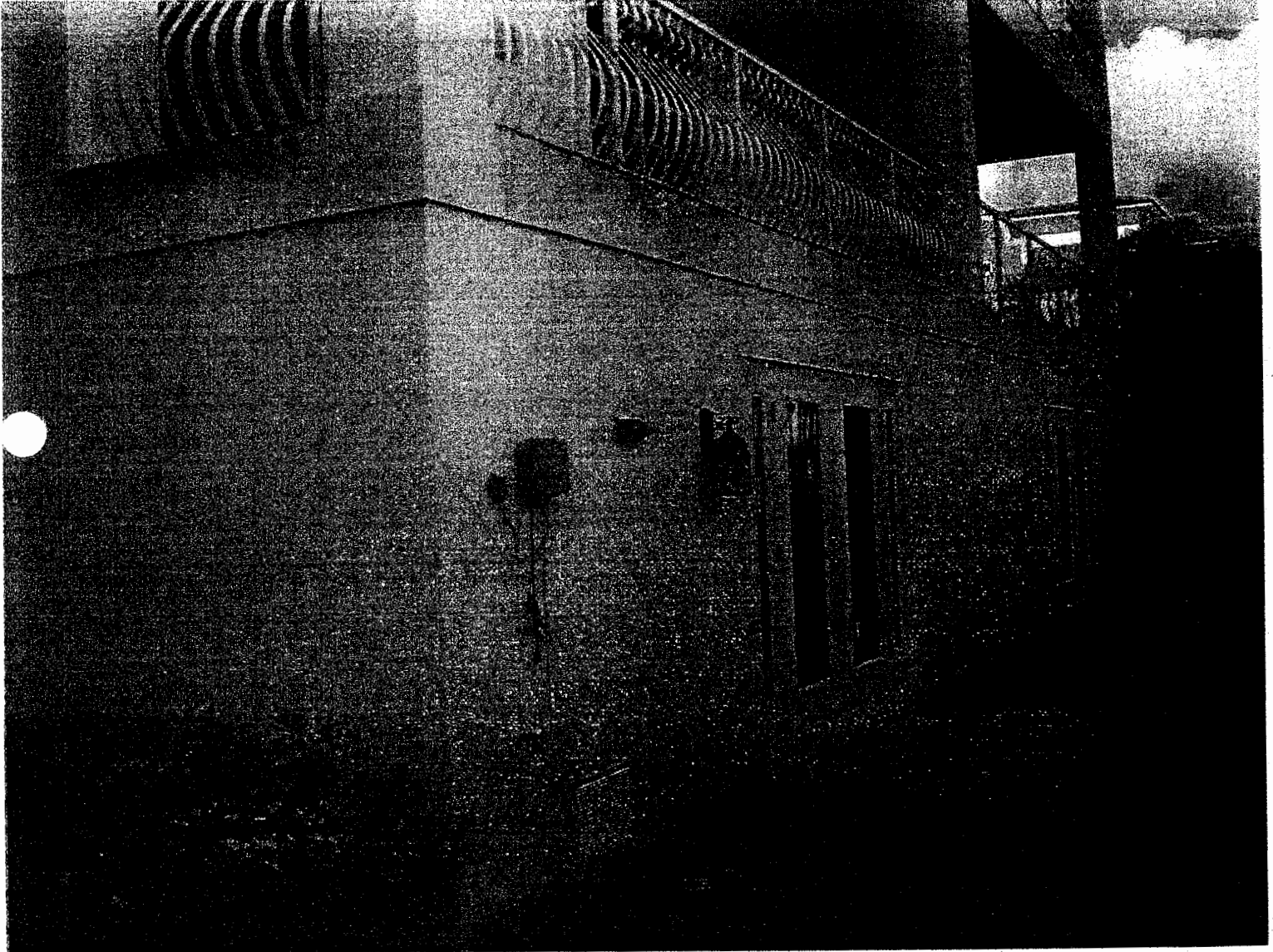
REAR VIEW 8-13-09

If submitting more photographs than will fit on the preceding page, affix the additional photographs below. Identify all photographs with: date taken, "Front View" and "Rear View"; and, if required, "Right Side View" and "Left Side View."