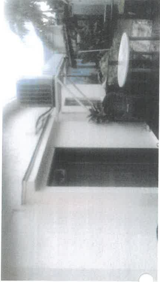
Rear View (South Side)

If submitting more photographs than will fit on the preceding page, affix the additional photographs below. Identify all photographs with: date taken; "Front View" and "Rear View"; and, if required, "Right Side View" and "Left Side View." When applicable, photographs must show the foundation with representative examples of the flood openings or vents, as indicated in Section A8.