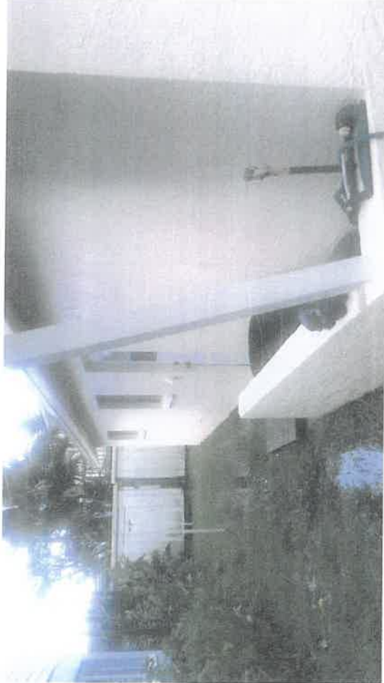
Left Side View (East Side)